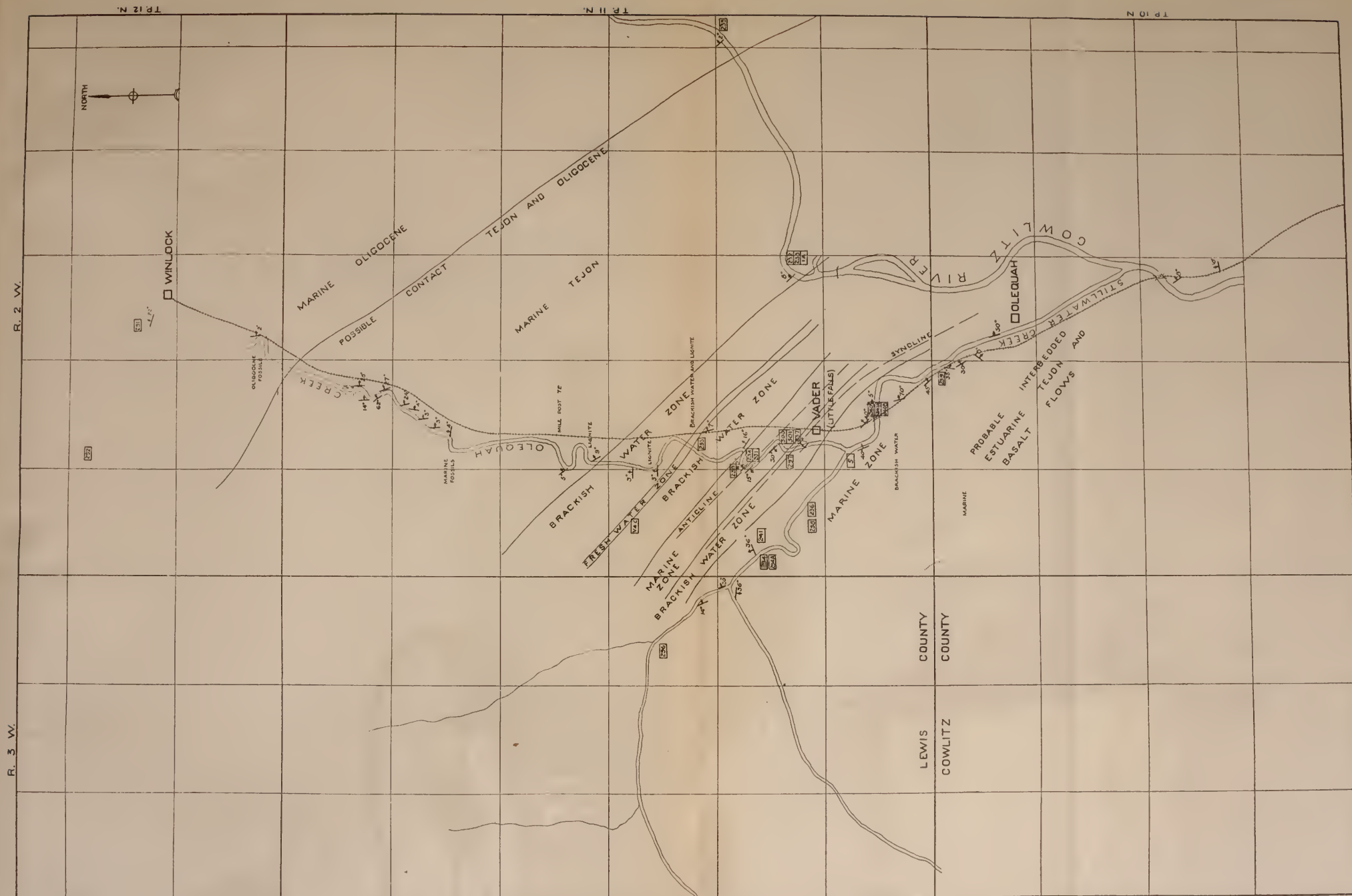
Sketch Map showing structural conditions along Cowlitz River between Olequah and Winlock.